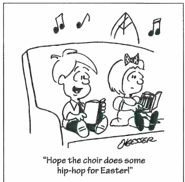
"Hope the choir does some hip-hop for Easter!"

Women's Board Meeting: Tuesday, April 25 at 9:30 a.m.